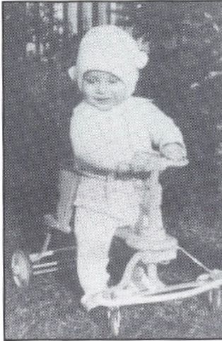
The young Gene Supernaw