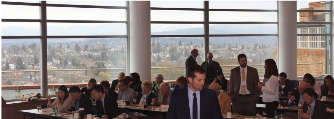
Taking a break to eat lunch and socialize