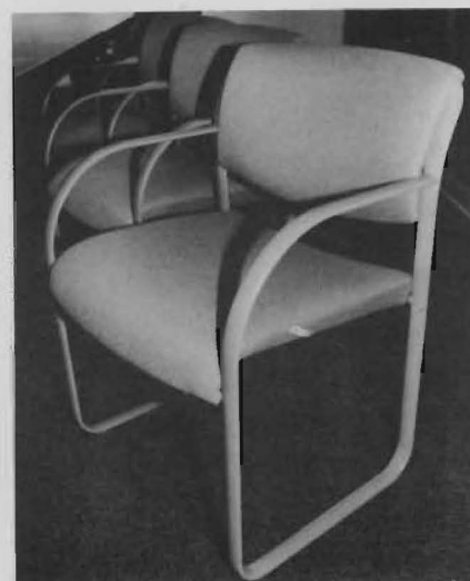
New Chairs for the 5th Floor Conference/Classroom