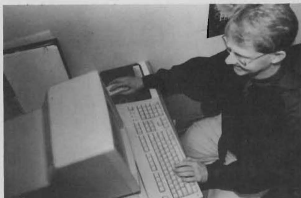
Graduate students enjoy using this Mac IIcx in the clinic

The Department also very much appreciates the Alumni Association for contributions of journal subscriptions, reprints, computer software, and memory upgrades for graduate student research.