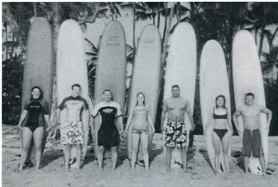
Surf's Up! The Class of 2002 gathers during the AAO meeting in Honolulu.