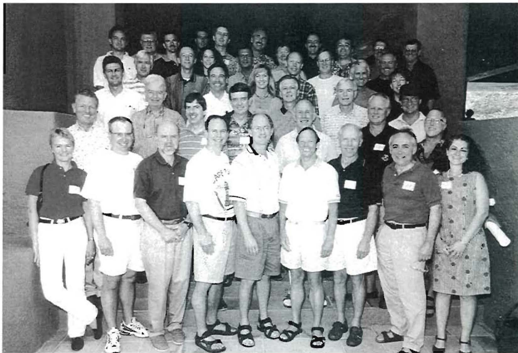
See anyone you know? The whole gang takes a break from the program to enjoy a moment for the camera...