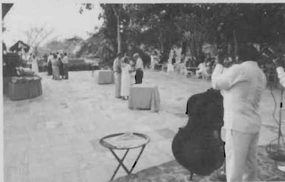
Lively local music and an outstanding sunset top off the welcome cocktail party!